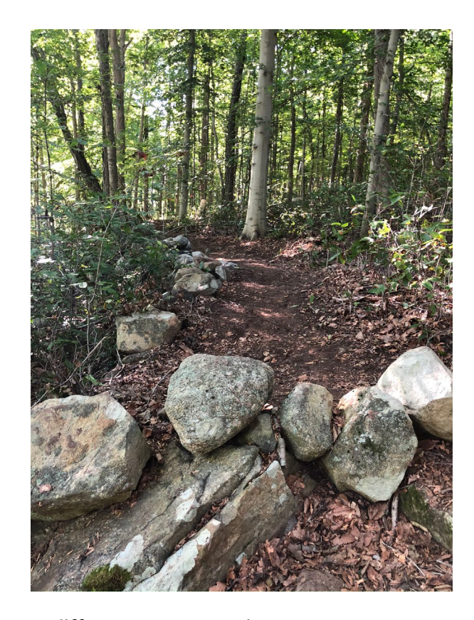
No rocks were moved, it is just the same part of the trail taken from two different vantage points.