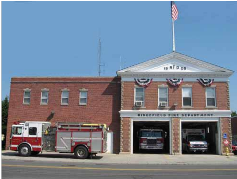
Photo 25: Ridgefield Fire Headquarters.

The Department also identified issues related to the communications system, apparatus replacement, potential demands due to an aging population, and other issues.