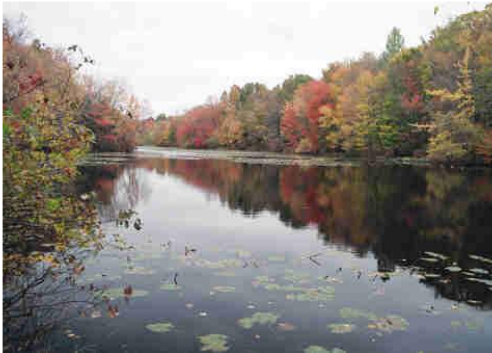
Wilton Side of Pond Looking Towards Ridgefield End