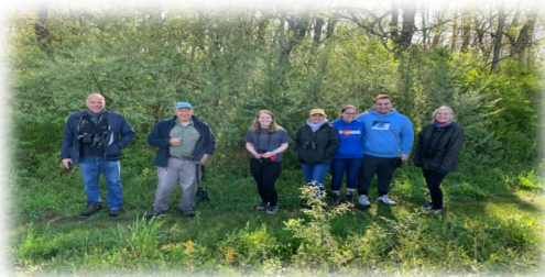
May 6 th Walkers

Ten participants attended the Conservation Commission's May 6th bird walk at Bennett's Pond State Park, one of Ridgefield's great open spaces. Early May was a fantastic time to be looking for birds in Ridgefield, as this was the peak time to see migrating birds passing through on their way from Central and South American wintering grounds to breeding grounds from here to the arctic. Our walk produced fifty-five species of birds, including some uncommon, hard to find species. At the Fox Hill Lake marsh, we observed two Virginia Rails, an extremely difficult to see "skulker." At Bennett's Pond we were treated to views of twelve different warblers, including the rare Hooded Warbler. Three flyover Broad-winged Hawks were a nice surprise. Deep in the woods we were surprised by the beautiful song of a tiny Winter Wren. After some careful scanning of the forest, we were able to locate this little guy singing his heart out on a small stump. And at the far end of Bennett's Pond, we were treated to looks at a secretive Marsh Wren!