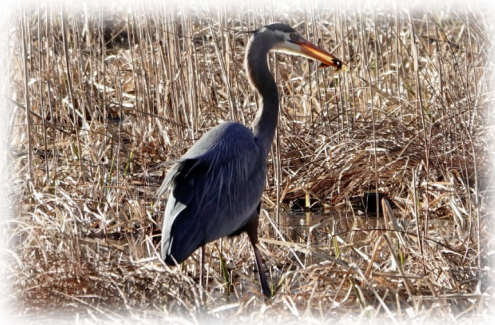
The Great Blue Heron

It is always so exciting to see who is visiting Bennett's Pond! The Great Blue Heron and masked Cedar Waxwing were spotted recently. There is nothing like Ridgefield's open spaces and trails! Make sure to take a hike and enjoy YOUR land this summer!