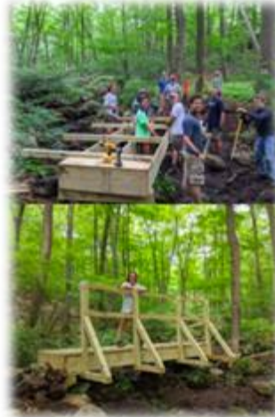
Sophie Desmarais Mar Joy Pond Bridge & Trail location