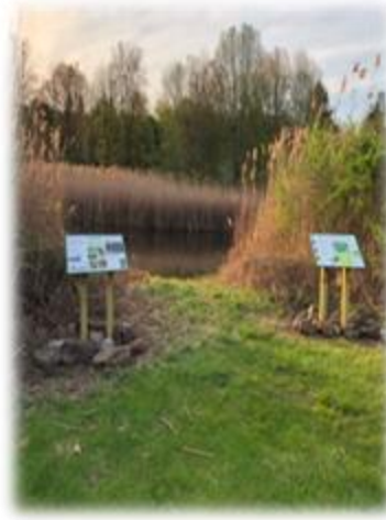
Joseph Isaac Educational Trail at Ridgebury Slopes