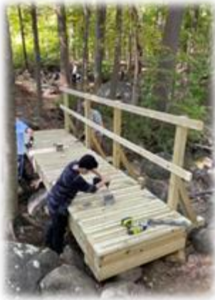
Quin Mahoney Schlumberger Trail Bridges