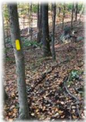
Gabriella Rogers Levy Yellow Trail Re-route