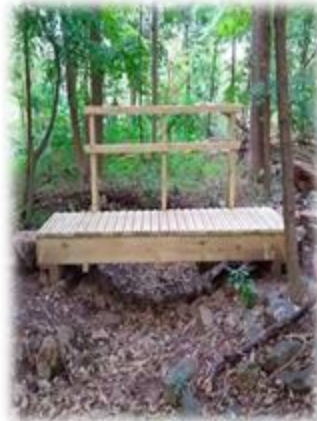
Lucas Kay Schlumberger Trail Bridge