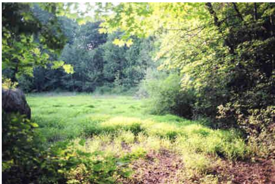
Snake Lake Wetlands in Peterson Gorge.