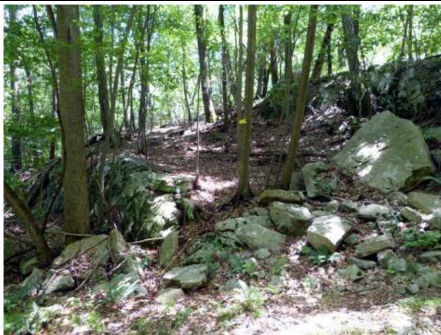
Old Sib Trail