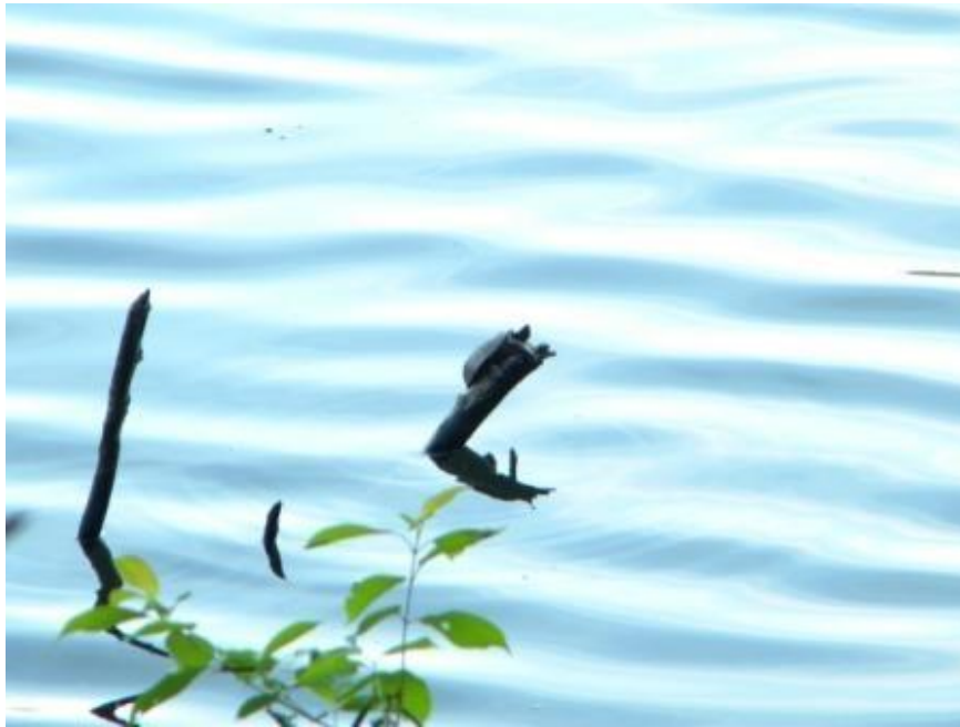
Musk Turtle at Lake Windwing