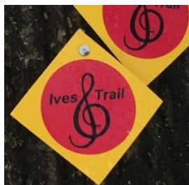
Ives Trail Marker

FEATURES: The Ives Trail runs from the Bennett's Pond and Pine Mountain trail systems in Ridgefield to the Terre Haute Preserve in Bethel, traversing a greenway that links these areas with Wooster Mountain State Park and Tarrywile Park in Danbury. The trail was completed in 2013, and its total length is about 14 miles. The trail features several spectacular viewpoints, views of many small lakes and reservoirs, and a great variety of forested areas. Difficulty varies, but much of the trail is moderate and there are some steep, difficult sections.