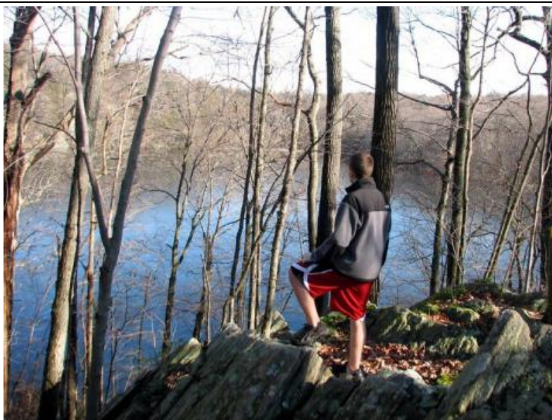
View of Great Pond from the trail