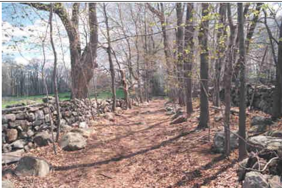
Trail Section: Unpaved Section of Lounsbury Lane