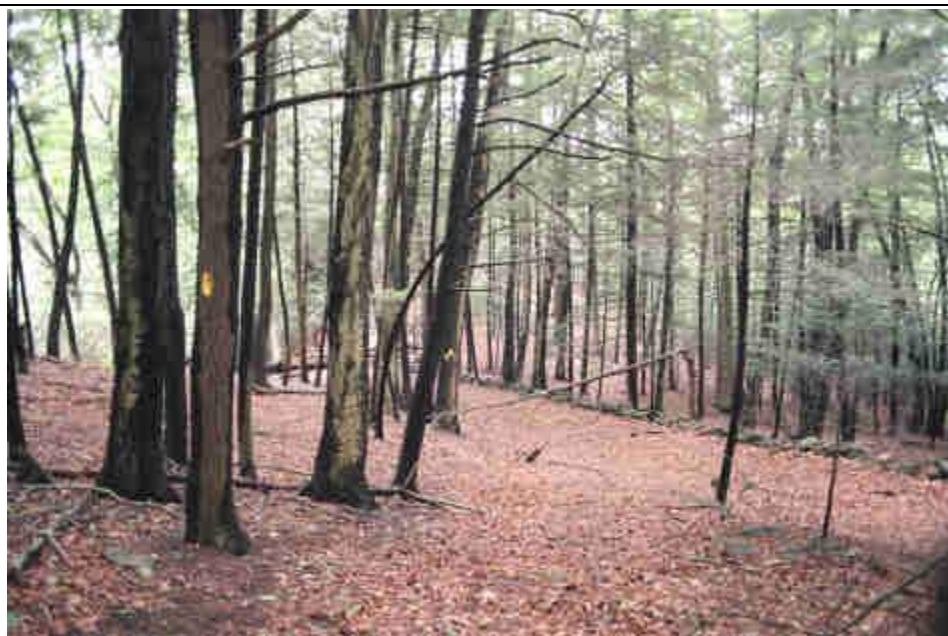
Wooded area of Bobby's Court

Size: 34 acres (Bobby's) and 9 acres (Topstone)