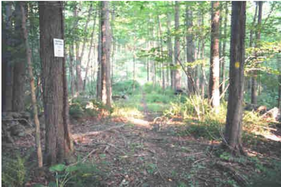
Trail entrance near Woodcock Lane