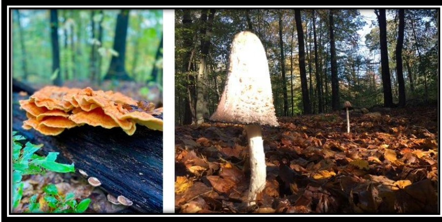
From left to right: ‘Chicken of the woods’ ( Laetiporus sulphureus ) & ‘Shaggy Inkcap or Shaggy mane’ ( Coprinus comatus )